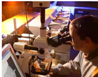
In-house testing and inspection facilities ensure a high quality product

improve its in-house manufacturing capability and capacity.